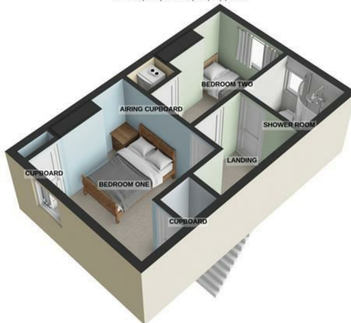
TOTAL FLOOR AREA : 499 sq.ft. (46.4 sq.m.) approx.

For illustrative purposes only. Decorative finishes, fixtures, fittings and furnishings do not represent the current state of the property. Measurements are approximate. Not to scale. Made with Metropix © 2026